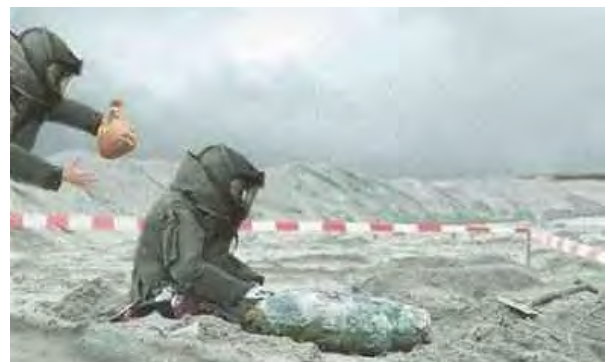
Bomb Squad Humor...