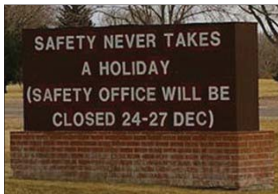
Sign at an unidentified USAF base...